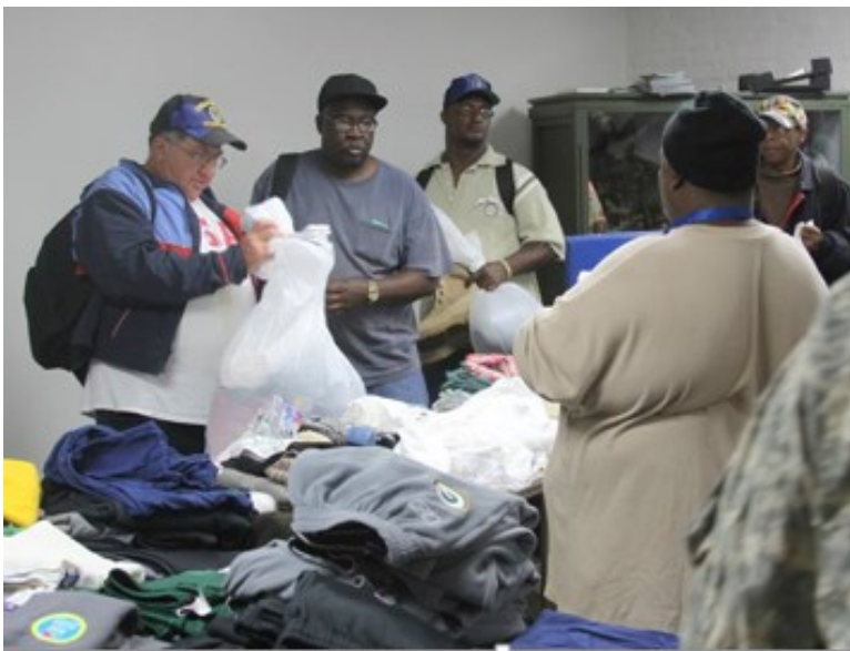
Local veterans lining up to receive clothing donations.

Cadets from the GEB also helped out at this year's Stand Down at the National Guard Armory on Richard Street. Stand Down acts as a temporary shelter for homeless and at risk veterans. It is a "hand up not a handout" as local veterans who are considered to be "at risk" are welcomed to a warm meal and other forms of aid. At Stand Down, veterans receive numerous services from financial and legal advice to medical and employment assistance. Cadets set up tables, cleaned up after the event and escorted veterans to check in. Because of Battalion volunteer efforts, Stand Down was able to serve over 200 Milwaukee Veterans.