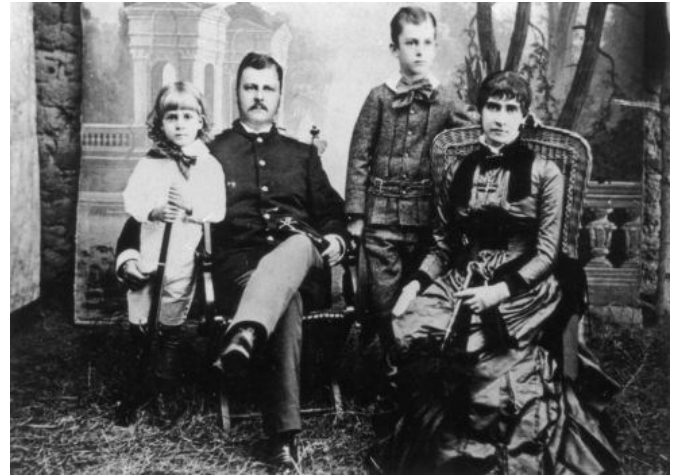
MacArthur family portrait. A young Douglas MacArthur is seen wearing white.

While many are aware of General MacArthur's contribution to the history books, few are aware of his connection to the city of Milwaukee and Marquette University. While he was not a born native of Milwaukee, MacArthur's father and grandfather were active members in the Milwaukee Community. The city would have such an influence on MacArthur, that he would later refer to it as his "ancestral home". Because MacArthur wanted to be an Officer, he would only consider Marquette an option if he did not get into West Point. In fact, it was a Milwaukee Congressman that awarded MacArthur the congressional nomination necessary to attend the Military Academy.