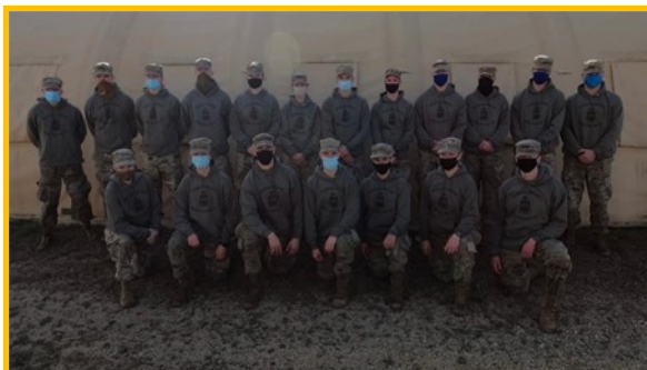
GEB 9-Man Team

Competing with schools across Wisconsin and Northern Michigan, the Golden Eagle Battalion came in first place in the 5-man Co-Ed category as well as the 9-man team. Both the 9-man and the 5-man teams will compete in the Brigade Ranger Challenge next semester! A win at the Brigade competition will take them to the Sandhurst competition at West Point.