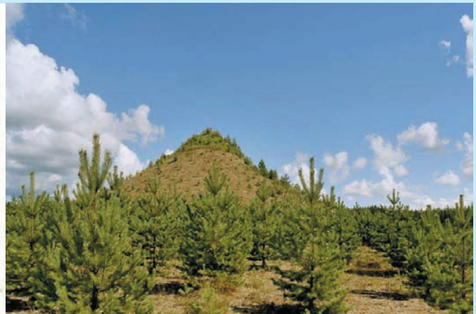
Tree Mountain, with Small Tree Pattern , Spring, 2002, Vibrachrome, 11" x 14" Photograph by Agnes Denes, © 2001 Agnes Denes