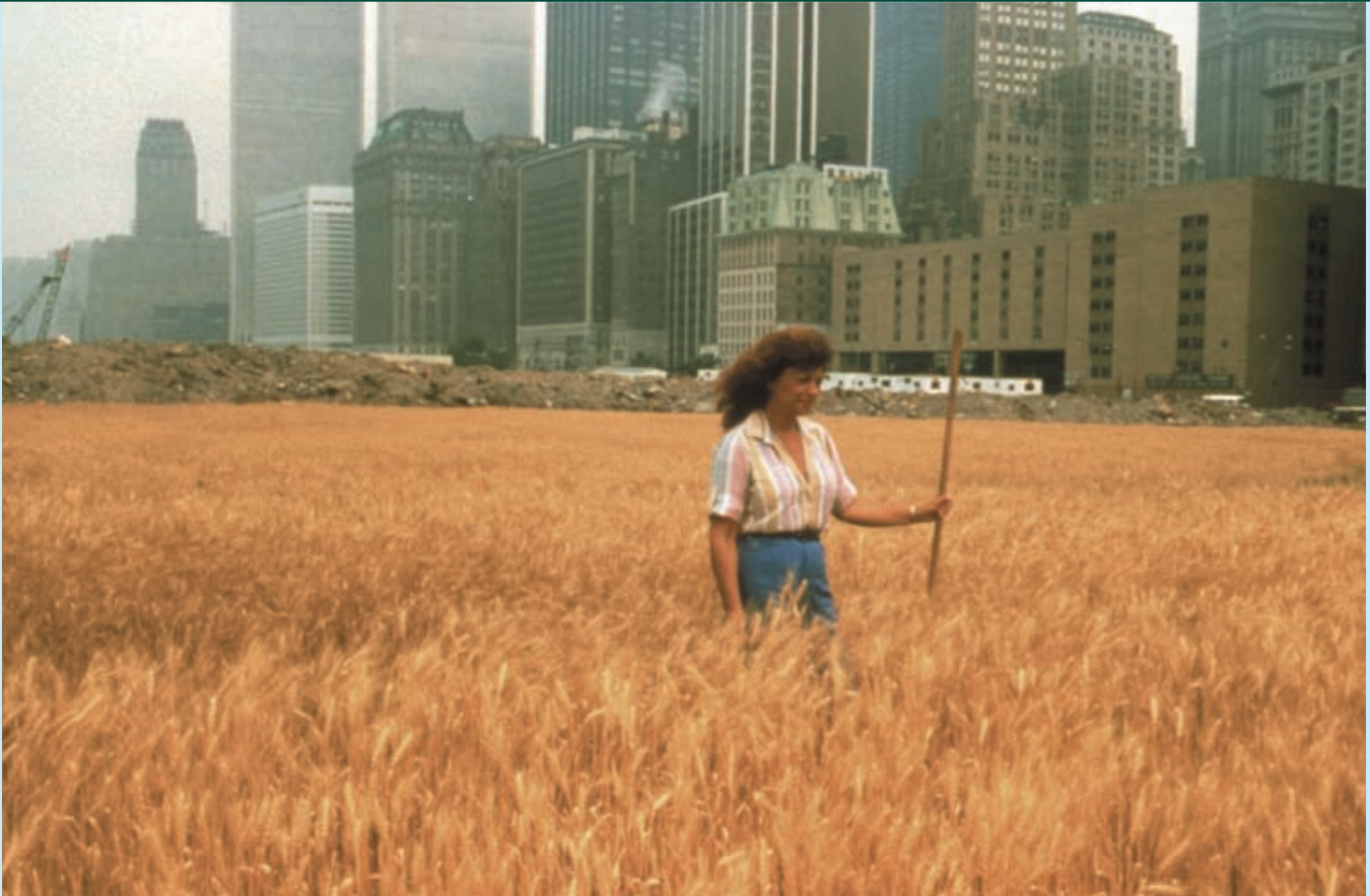
Wheatfield—A Confrontation: Battery Park Landfill, Downtown Manhattan, 1982, cibachrome, 16 x 20 in., photograph by John McGrail, © 1982 Agnes Denes

The Haggerty Museum of Art is pleased to present Agnes Denes: Projects for Public Spaces , a major retrospective exhibition of work by the internationally recognized conceptual and environmental artist and writer Agnes Denes. The exhibition surveys the artist's public and environmental projects from 1968 to present in a variety of media. Drawings, works on paper, three-dimensional models and text describe various projects while photographs, often taken by the artist, document actual public spaces created by Denes around the world.