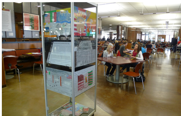
Daniel M. Soref Learning Commons in the Golda Meir Library at UWM

By popular demand, the Haggerty will add Water Across Curriculum as a new workshop offered to area schools beginning in 2013. A variety of paintings, prints and photographs from the Haggerty's permanent collection, featuring images of water, serve as the focal point for the workshops. Portraits of people living in Milwaukee and around Lake Michigan by local photographer Kevin J. Miyazaki have also been incorporated into the project. Like Picasso Across Curriculum , Water Across Curriculum is accompanied by an in-depth curriculum, available online via the Haggerty's website. This project is also funded by the Mary L. Nohl Fund of the Greater Milwaukee Foundation.