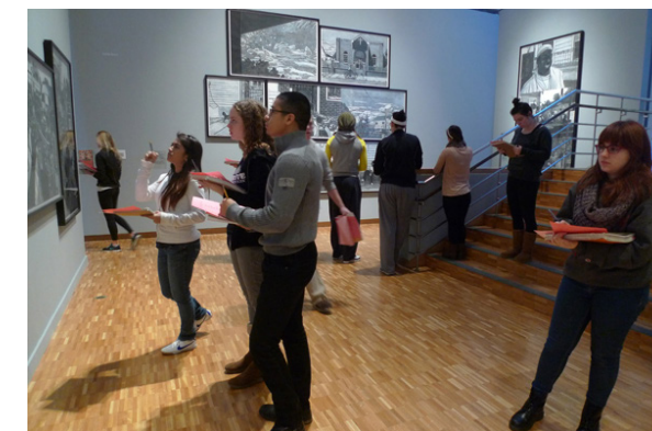
Marquette communication students work on a content analysis assignment