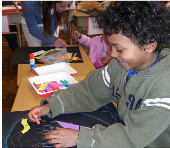
Student in Picasso Across Curriculum program

During the 2012-13 school year, the Haggerty's Picasso Across Curriculum program will provide over 70 workshops, serving approximately 2,000 students. This outreach program for 1st through 8th grade students uses the Haggerty portfolio Picasso-Guernica as a point of departure to explore Picasso's life and works. An online, in-depth curriculum guide provides teachers with a variety of ways in which the Picasso portfolio can be integrated into a variety of classes. The Picasso project has the dual focus of training Marquette education students to integrate the visual arts into classroom curriculum while teaching elementary school students about Pablo Picasso and associated subject matter. This project is funded by the Mary L. Nohl Fund of the Greater Milwaukee Foundation.