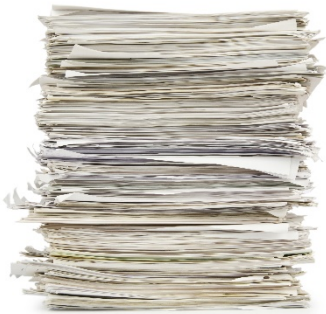
Evidence “directly related” to the allegations

What happens to the rest of the “investigative file” that contains the “non-relevant evidence?”