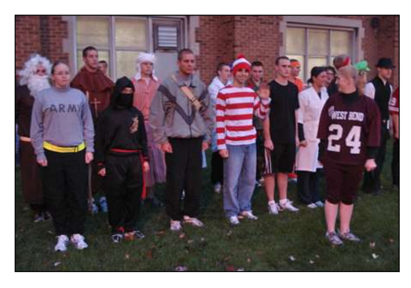
Army ROTC – Halloween Fun Run

Additional pictures and explanation of each event can be accessed at the Golden Eagle Battalion website at http://www.marquette.edu/rotc/army