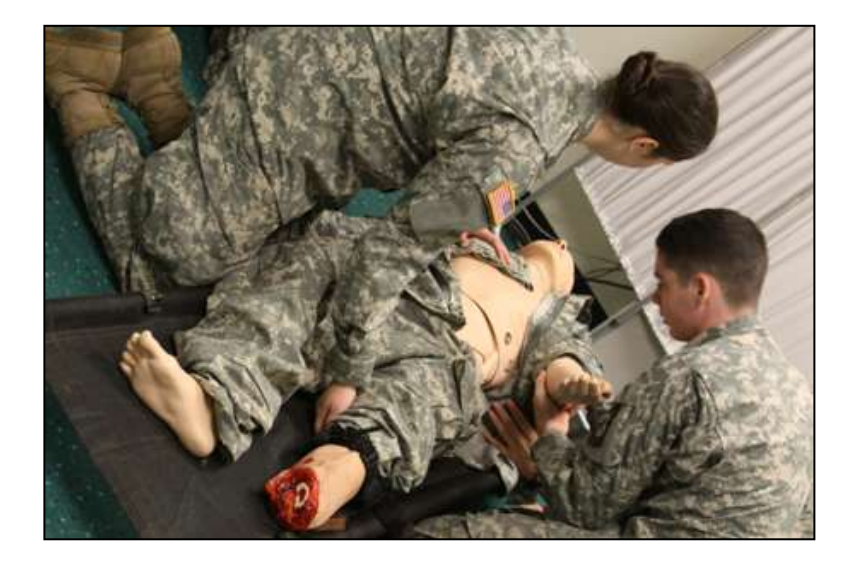
First aid training at the Marquette Nursing School