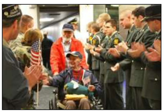
Army ROTC Cadets welcome home WWII vets participating in Honor Flights to Washington DC.