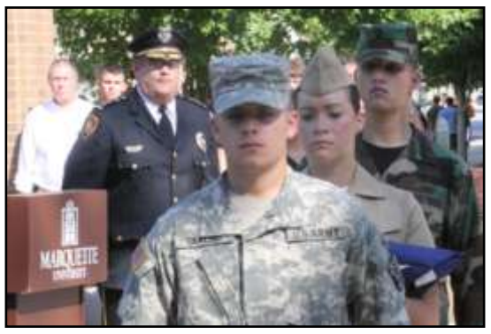
Tri-Service ROTC - 9-11 Ceremony