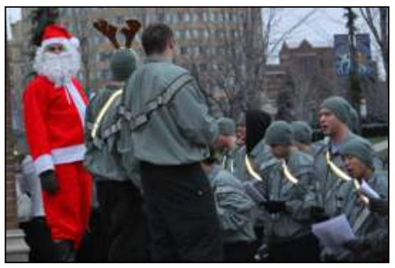
Army ROTC Christmas Caroling at Marquette

Additional pictures and explanation of each event can be accessed at the Golden Eagle Battalion website at http://www.marquette.edu/rotc/army