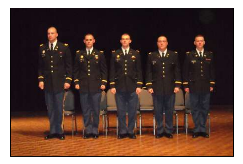
December 2009: Army ROTC Cadets at Marquette University were recently commissioned as Second Lieutenants in the U.S. Army. We are on track to commission 22 officers into the Active Duty, U.S. Army Reserve and National Guard in 2010!