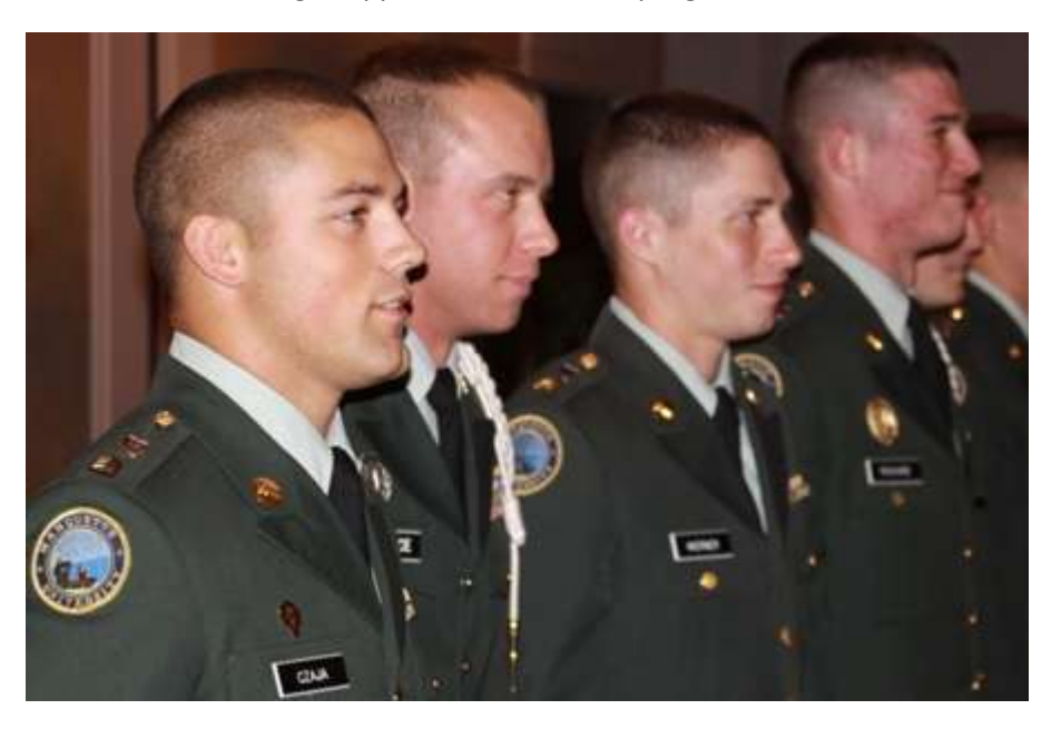
Dining-In: Army ROTC Cadets at Marquette University held their annual dining-in ceremony. The Dining-In is a formal dinner held by a military unit or organization.

During the first semester, our cadre and cadets excelled in the ROTC mission: To recruit, retain, develop, and commission the future officer leadership of the United States Army and motivate young people to be better citizens through support of local JROTC programs.