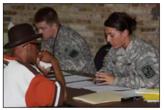
Army ROTC supports Stand Down. Stand Down is designed and intended to bring a wide array of pre-existing specialized resources together at one location to homeless and at-risk veterans.