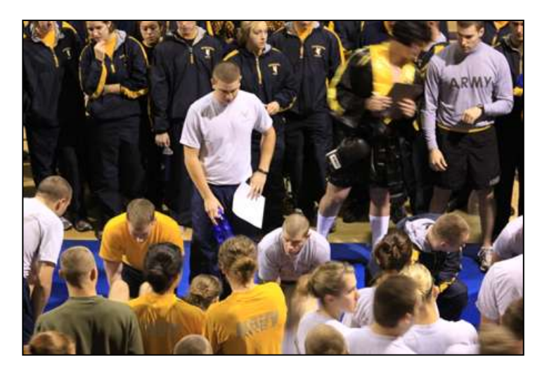
Tri-ROTC Competition: Army Men and Women were victorious