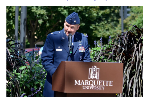
Each year, an honorary guest speaker shares somber thoughts regarding our country's pride and freedom on this tragic day.

Many of the Golden Eagle Battalion Cadets volunteered their time to become a part of this memorable tribute as flag was lowered to half staff. It was a moving experience for everyone involved and reminded us that our nation is stronger at its core than any other organization. We stand united on this day of tragedy.