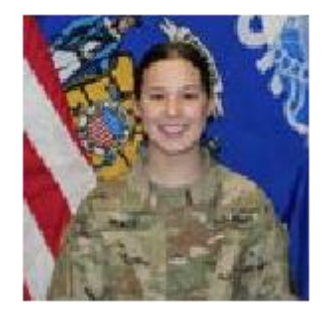
CDT Plaza, Margaret Air Assault School