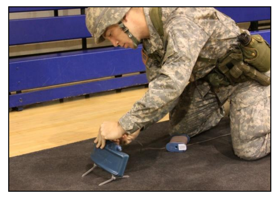
December 2010 – Leadership Lab Golden Eagle Battalion Cadets test what they learned in the Squad Skills Test Competition. Squad members were randomly assigned to complete timed and graded tasks, to include: radio communications, SALUTE reports, first aid, 9 Line MEDEVAC, map reading, applying camouflage, and weapons assembly with functions check.