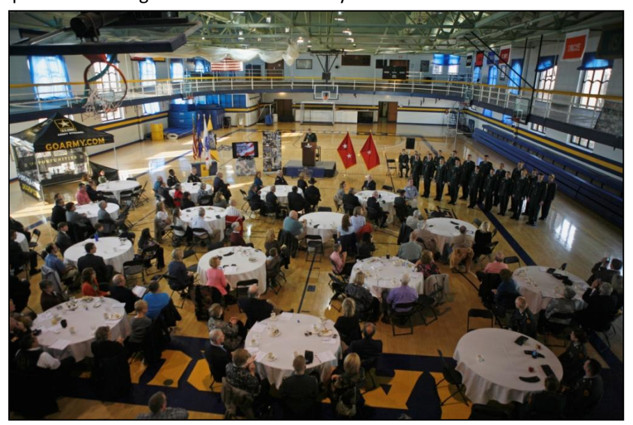
Alumni, Cadets, Cadre, parents, friends, and distinguished guests filled the Old Gym during the Wall of Honor and Contracting Ceremony on November 11, 2010.

The Fall Semester started with the Cadets hitting the ground running—and they didn't slow down until after final exams week. November was a big month as the Army ROTC department, along with Marquette University's Klinger College of Arts & Sciences, celebrated Veterans Day by remembering the past and looking forward to future Army Leaders.