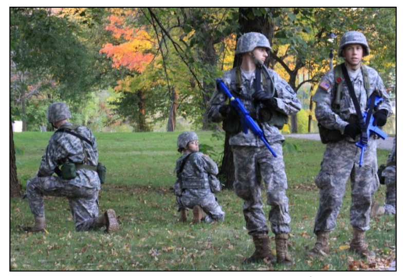
<u>Ocotober 2010 – Leadership Lab</u> Cadets made the most of outdoor training opportunities before the winter weather set in. After weeks of practicing individual skills, Cadets practiced collective tasks and tactics in fire teams and squads.