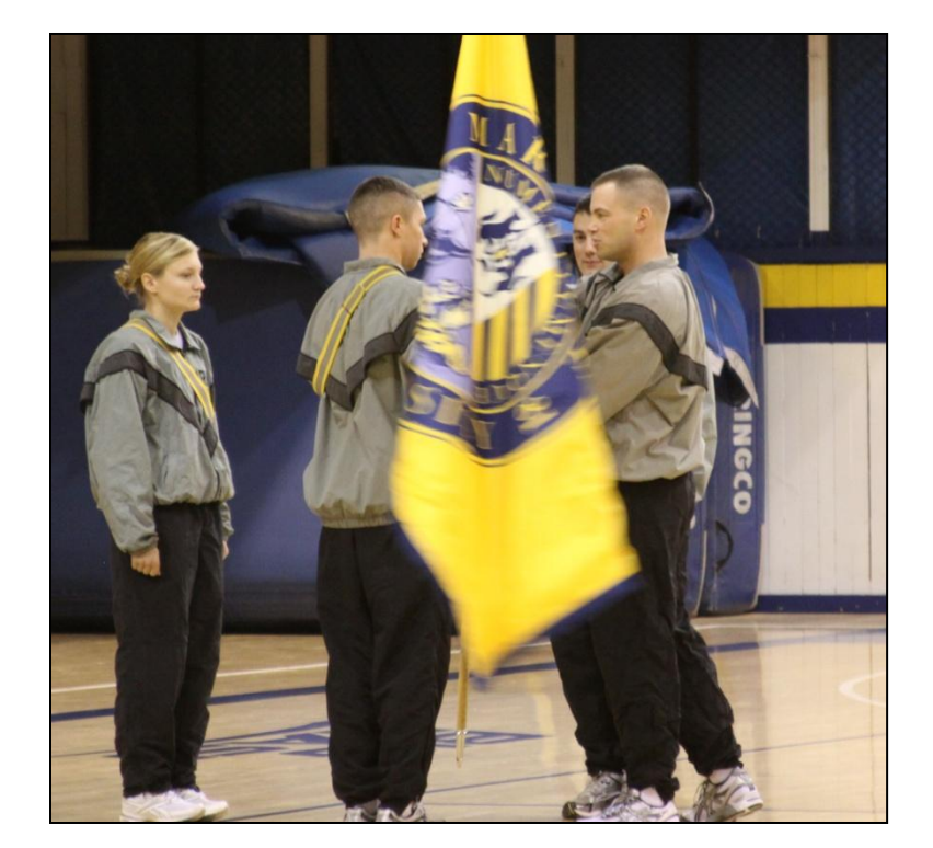
<u>January 2011 – Cadet Change of Command</u> The Golden Eagle Battalion Cadets welcomed new Battalion and Company level leadership for the Spring Semester. The Battalion also stood up Charlie Company, a company of MS-III Cadets preparing to go to LDAC this summer.