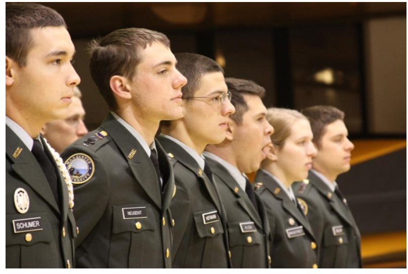
<u>January 2011 – Leadership Lab</u> To start the semester off strong, the Golden Eagle Battalion conducted an in-ranks inspection. This lab also included an award ceremony to recognize outstanding physical fitness and scholastic achievement.