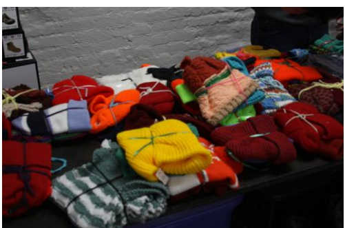
Cadets helped hand out the donated clothing to the homeless veterans.