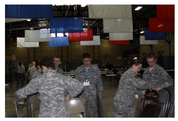
(Above) Cadets set up for the two day Stand Down.