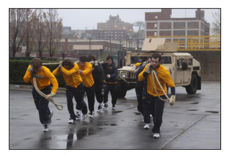
Marquette Men's Lacrosse team members pull a HMMWV tactical vehicle as part of a maintenance challenge in the Iron Squad competition.