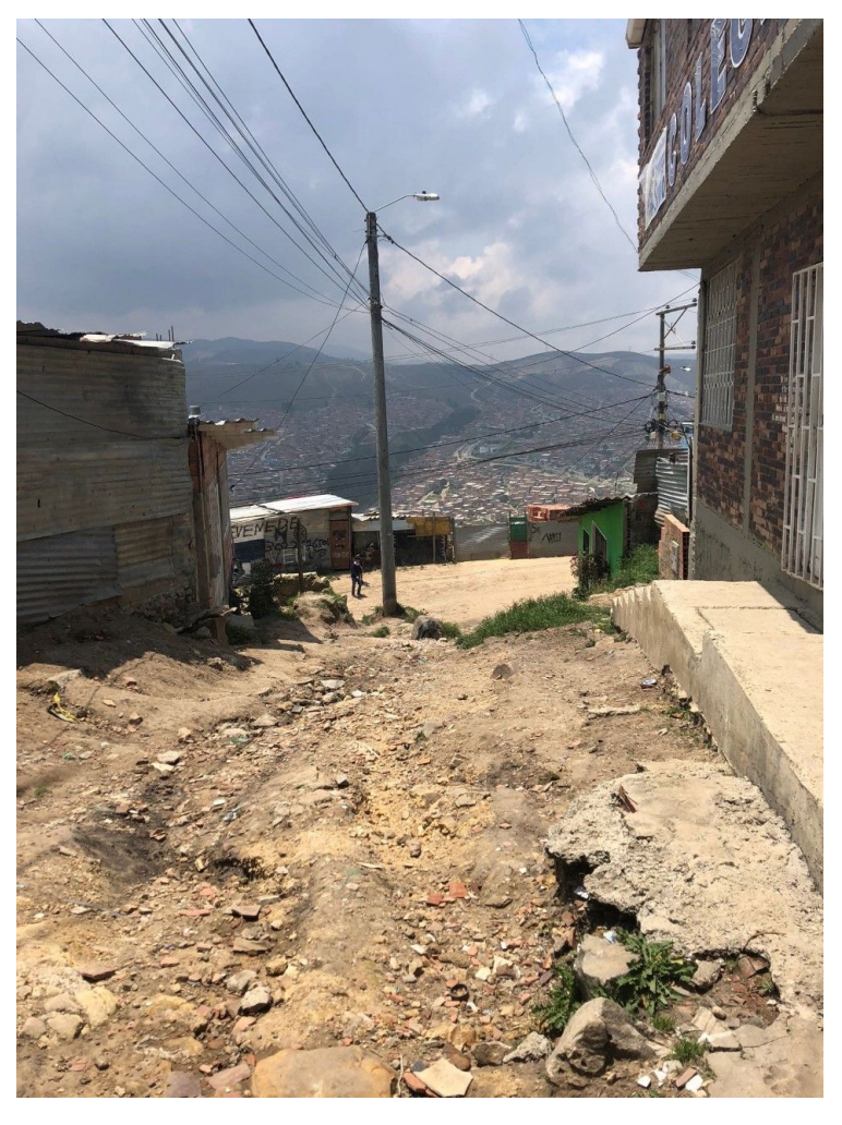
Figure 1: Domingo Savio's community