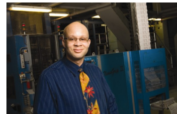
Assistant Managing Editor/News Operations, Milwaukee Journal Sentinel

"The College of Professional Studies has been the best investment I've ever made. The faculty, staff, and students have a spirit of excellence that flows outside the classroom and into the community. The College teaches us that earning a degree is meaningless if you can't transfer your knowledge to helping others. My experience has been empowering and transformational."