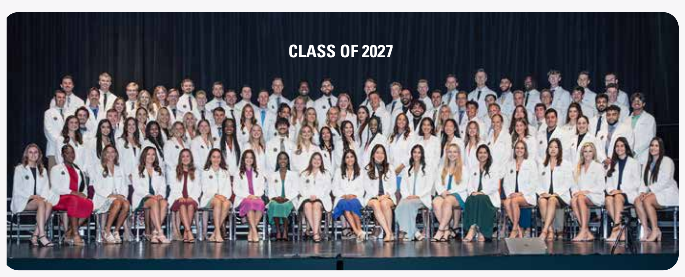
White Coat Ceremony Marquette University School of Dentistry Class of 2027.