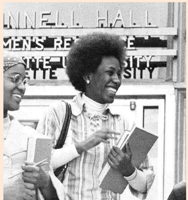
EOP students (1969)