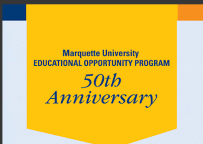
EOP 50TH PAGE 6