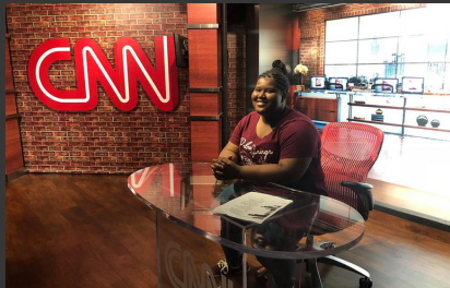
SUM UP THE SUMMER (EVENTS) PAGE 2