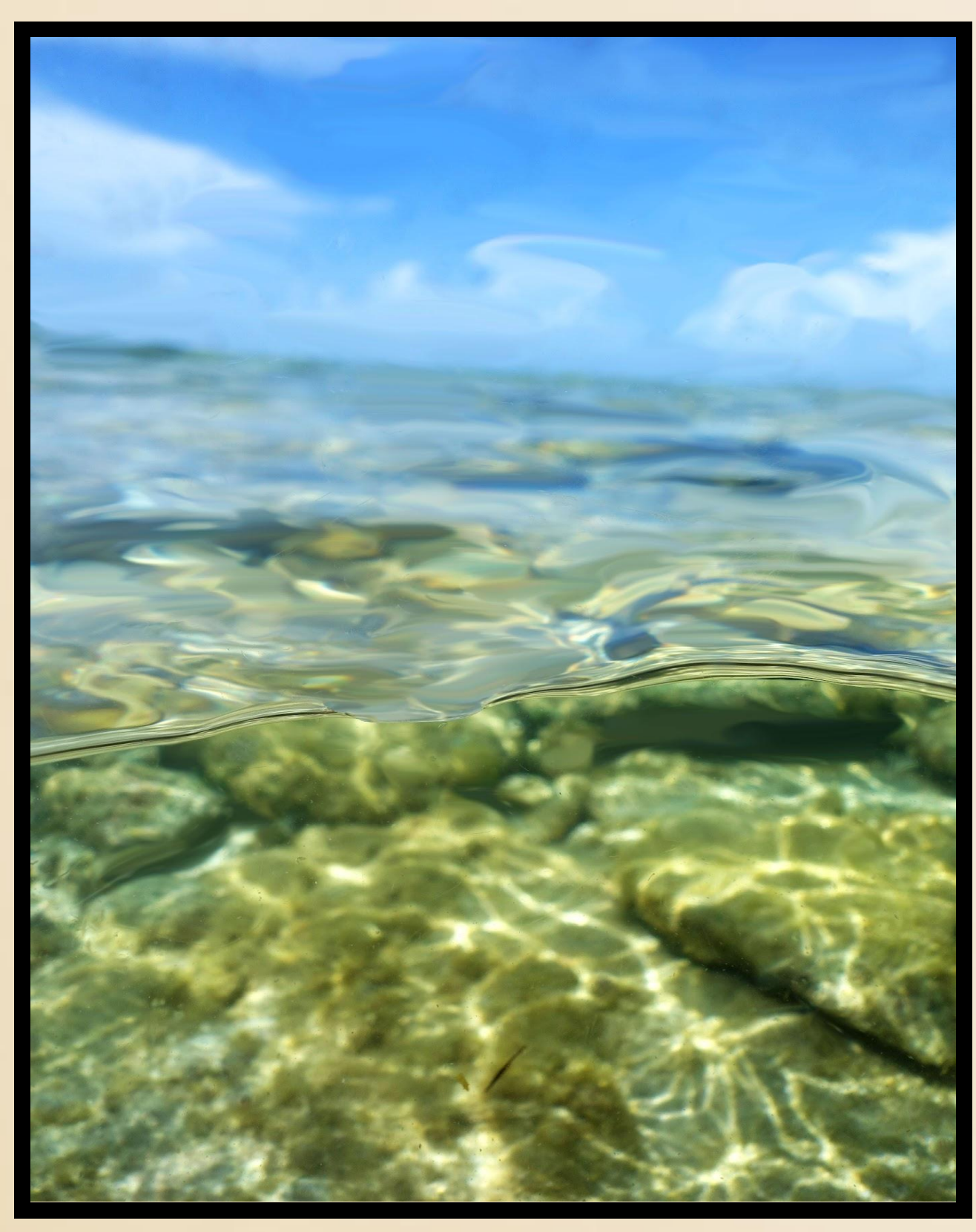
Sadaf Nasir, "Crystal Clear"