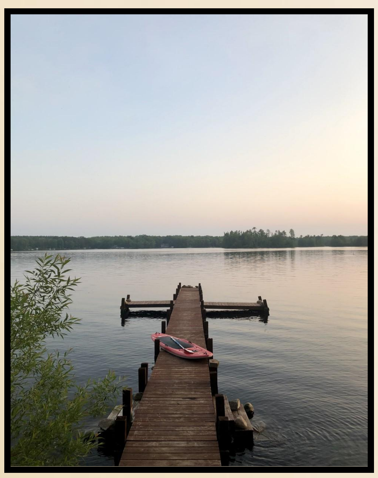
Nikita Deep, "Hiraeth Lake"