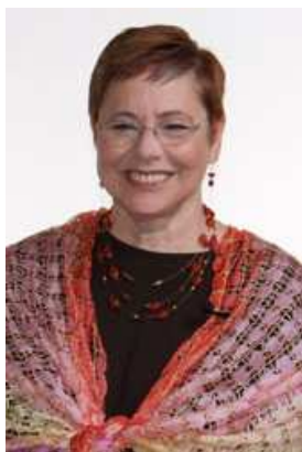
The Author of Writing Matters: Rebecca Moore Howard

...to themselves. Writing Matters encourages writers to take their writing seriously and to approach writing tasks as an opportunity to learn about a topic and to expand their scope as writers. Students are more likely to write well when they think of themselves as writers rather than as error-makers. By explaining rules in the context of responsibility, Writing Matters addresses composition students respectfully as mature and capable fellow participants in the research and writing process.