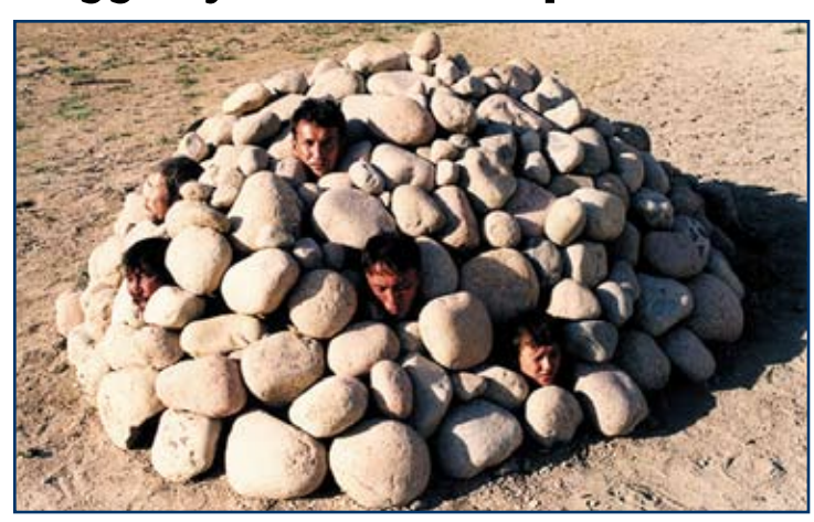
Erbosyn Meldibekov (Kazakhstan), Pol Pot, 2002, photograph