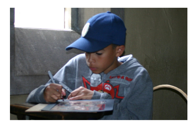
Young stained glass artist at work in St. Joan of Arc Chapel