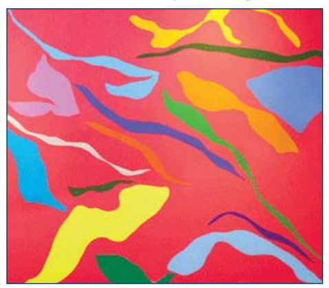
Ray Parker, Untitled , 1968 Oil on canvas, 90 x 110 in.

A renowned second generation Abstract Expressionist, Parker (1922-1990) was influenced by Cubism in his early career. His work as a jazz trumpeter also influenced his work.