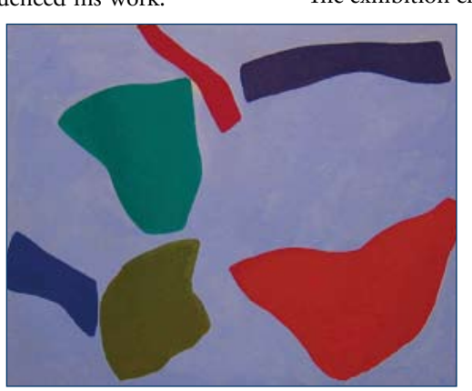
Ray Parker, Untitled , 1972 Oil on canvas, 24 x 30 in.

Preparations for the Museum's external review will incorporate the Haggerty Friends' strategic plan prepared during the last year with the aid of the Haggerty Friends officers and board members and the Museum's strategic plan