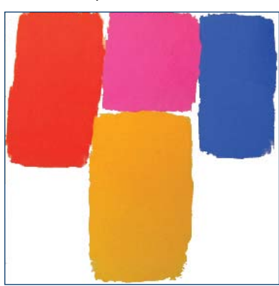
Ray Parker, Untitled , 1964 Oil on canvas, 65 x 68 in.

The exhibition closes on Sunday, October 8.