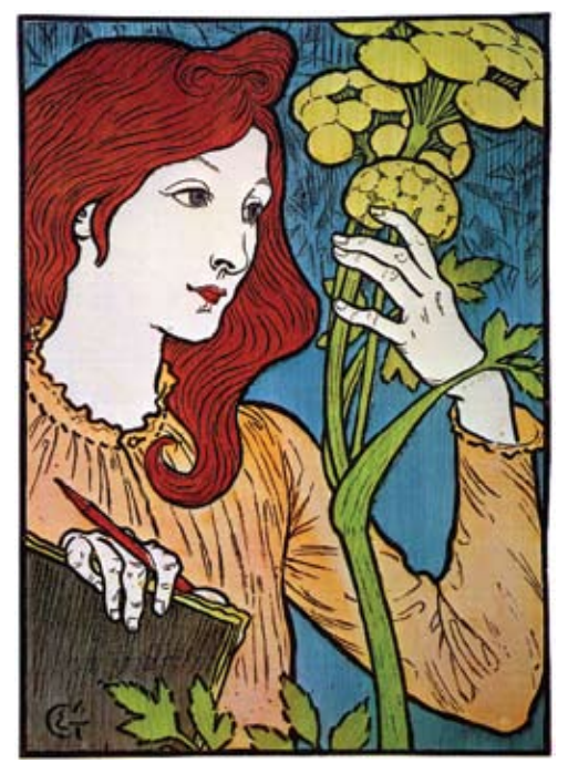
Eugène Grasset, Salon des Cent–Exposition Grasset , 1894 Color lithograph, 24 x 16 1/8 in. Collection of Milton and Paula Gutglass

Nineteen color lithographs created by artists Eugène Grasset, Alphonse Mucha and Paul Berthon between 1894 and 1901 will be featured in the exhibition. Art Nouveau was an international art movement that emphasized decoration and craftsmanship and was a reaction to the Industrial Revolution and historical-based art of the 19th century. Even though lithographic posters were prized as fashionable art objects, many were destroyed during the economic depression following World War II or used for wrapping