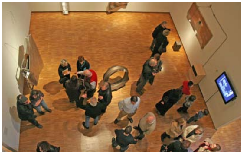
Opening reception of the Current Tendencies exhibition