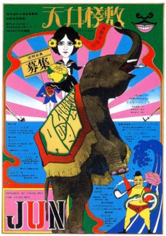
TADANORI YOKOO Japanese (born 1936) Recruiting Members for Tenjo Sajiki, 1967 Silkscreen on paper 40 1/2 x 28 3/5"