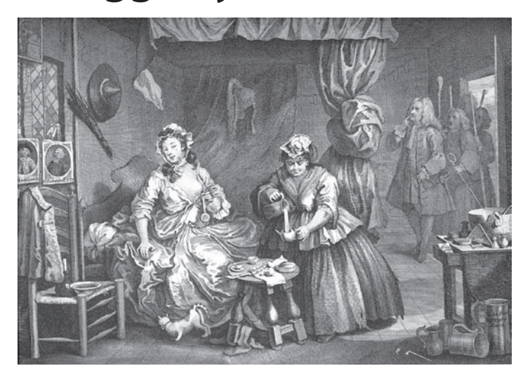
William Hogarth, A Harlot's Progress, Plate 3, Moll has gone from kept woman to common prostitute. 1732. etching, anonymous gift