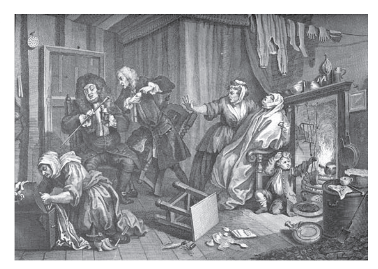
William Hogarth, A Harlot's Progress, Plate 5, Moll dying of syphillis, 1732, etching, anonymous gift