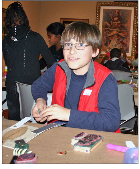
Students from MacDowell Montessori School working on Lam-inspired Spirit Creatures.