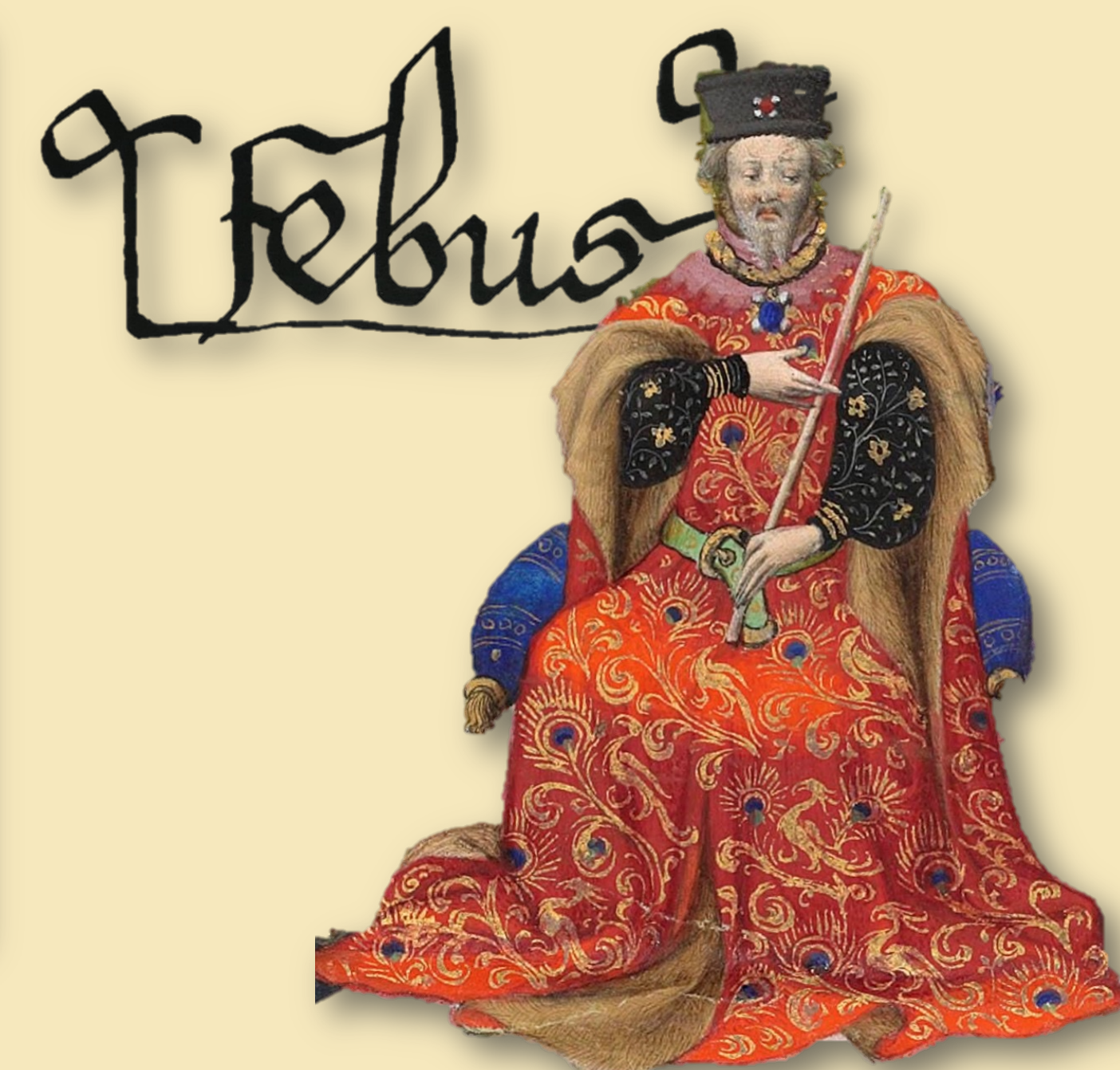
"Final instructions before the hunt," New York, Morgan Library, MS M. 1044, fol. 4r (detail).