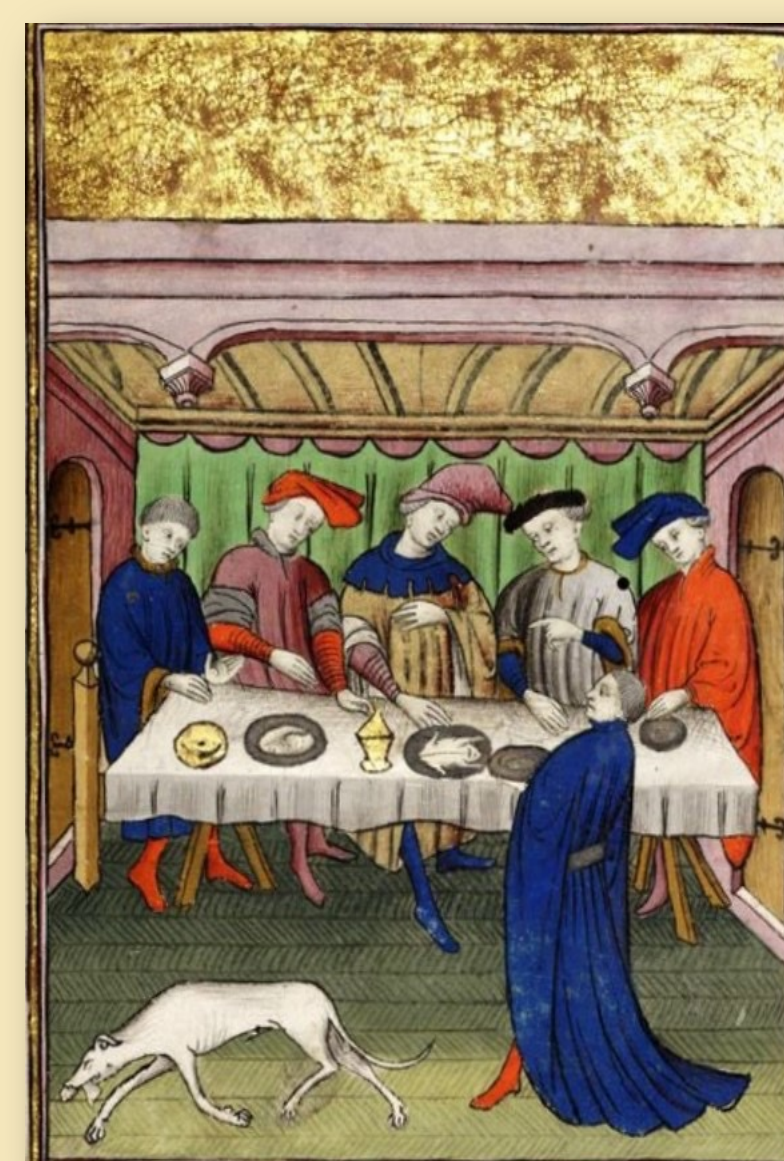
Young Gaston attempts to poison his father, Bruxelles, Bibliothèque Royale de Bruxelles, MS II 88, fol. 16v 1410.