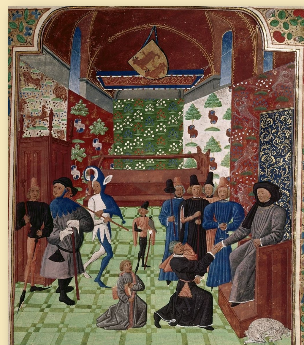
Jean Froissart kneeling before Gaston III Fébus, London, British Library, MS Royal 14 D.V, fol. 8r.