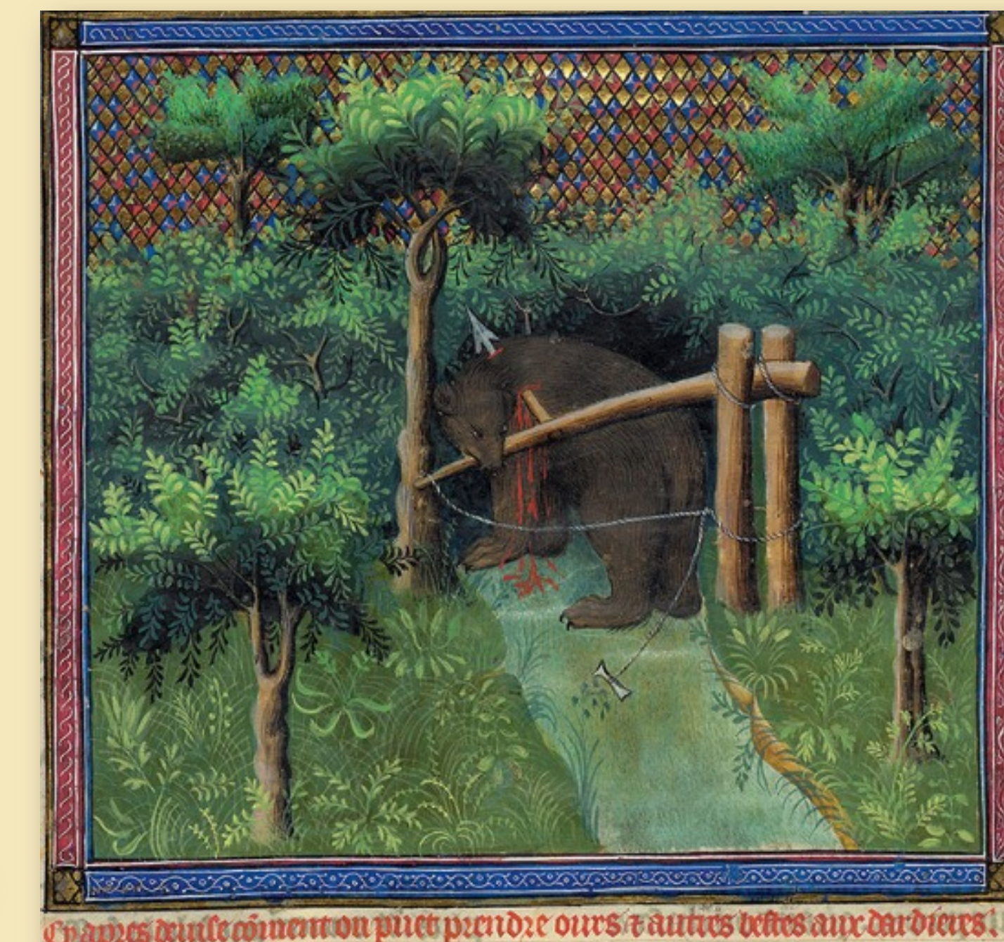
Bear capture, New York, Morgan Library, MS M. 1044, fol. 95v (detail).