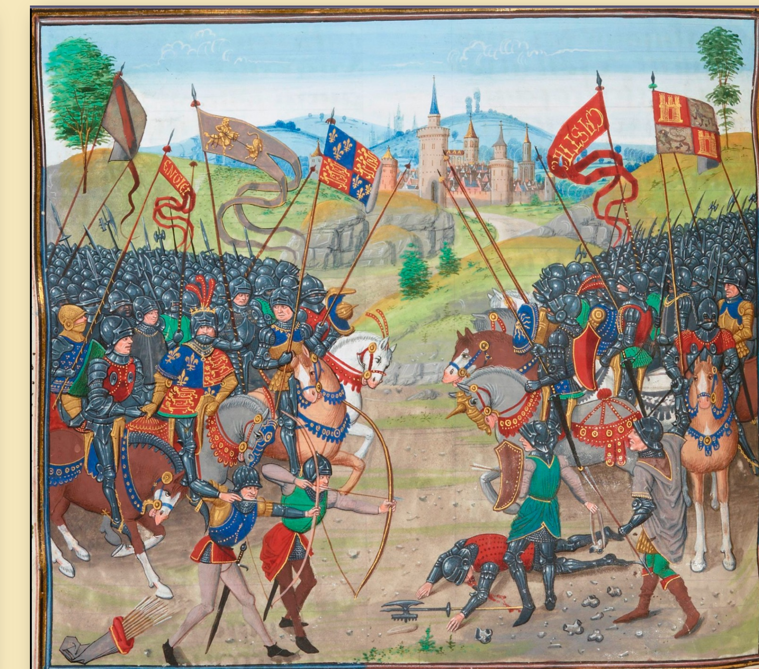
The Battle of Najera: 15th century illustration from Jean Froissart's Chroniques , Paris, Bibliothèque Nationale de France, FR. 2643, fol. 312v (detail).