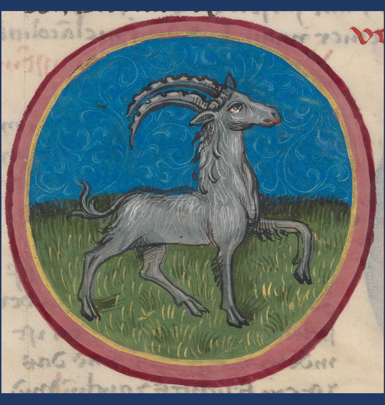
The ibex, an animal that teaches discernment to a desert hermit in Sulpicius Severus' Dialogues . (Source: Zürich, Zentralbibliothek MS C 54 fol. 23r; public domain).