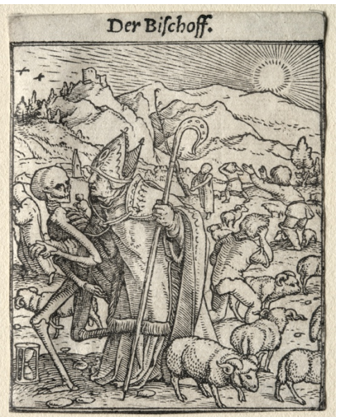
The Dance of Death- The Bishop (1929) by Hans Holbein<sup>1</sup>